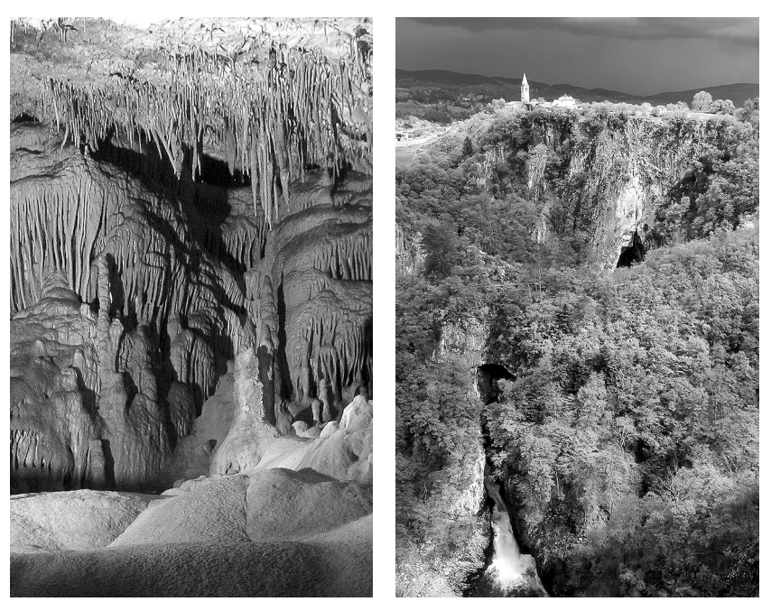
Škocjan Caves

Note : Warm clothes and footwear are recommended for the one-and-a-half hour tour of the Škocjan Caves, where the temperature is a constant 12°C.