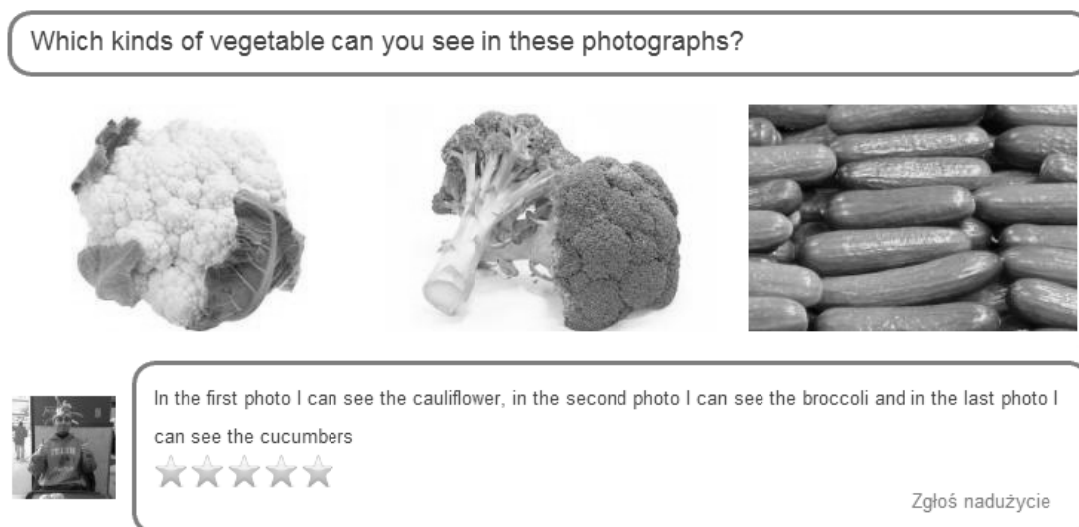
Figure 3: Examples of tasks in writing and spelling